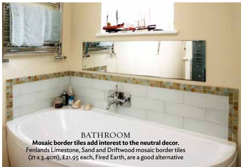
BATHROOM Mosaic border tiles add interest to the neutral decor. Fenlands Limestone, Sand and Driftwood mosaic border tiles (21 x 3.4cm), £21.95 each, Fired Earth, are a good alternative