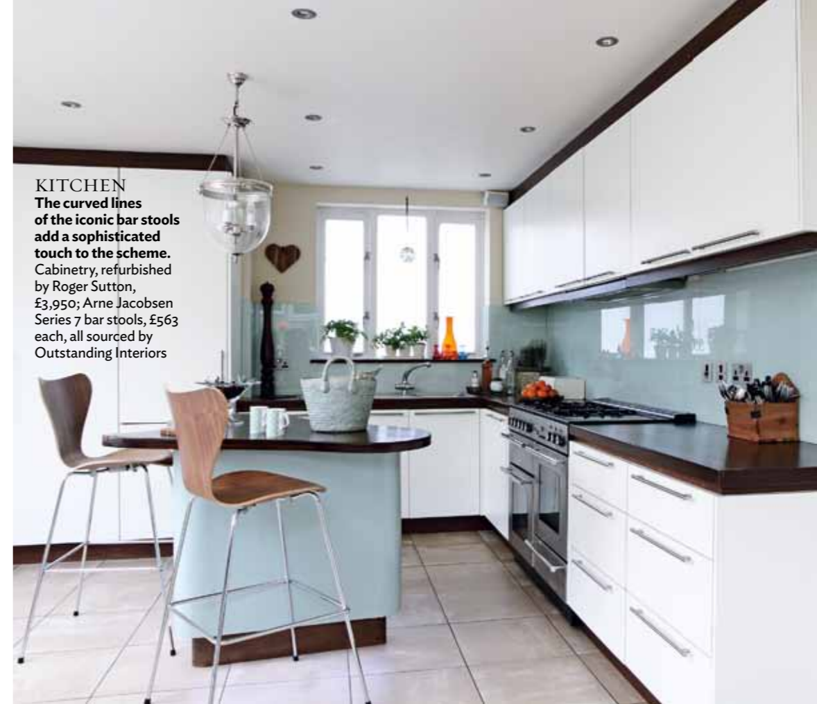
KITCHEN The curved lines of the iconic bar stools add a sophisticated touch to the scheme. Cabinetry, refurbished by Roger Sutton, £3,950; Arne Jacobsen Series 7 bar stools, £563 each, all sourced by Outstanding Interiors