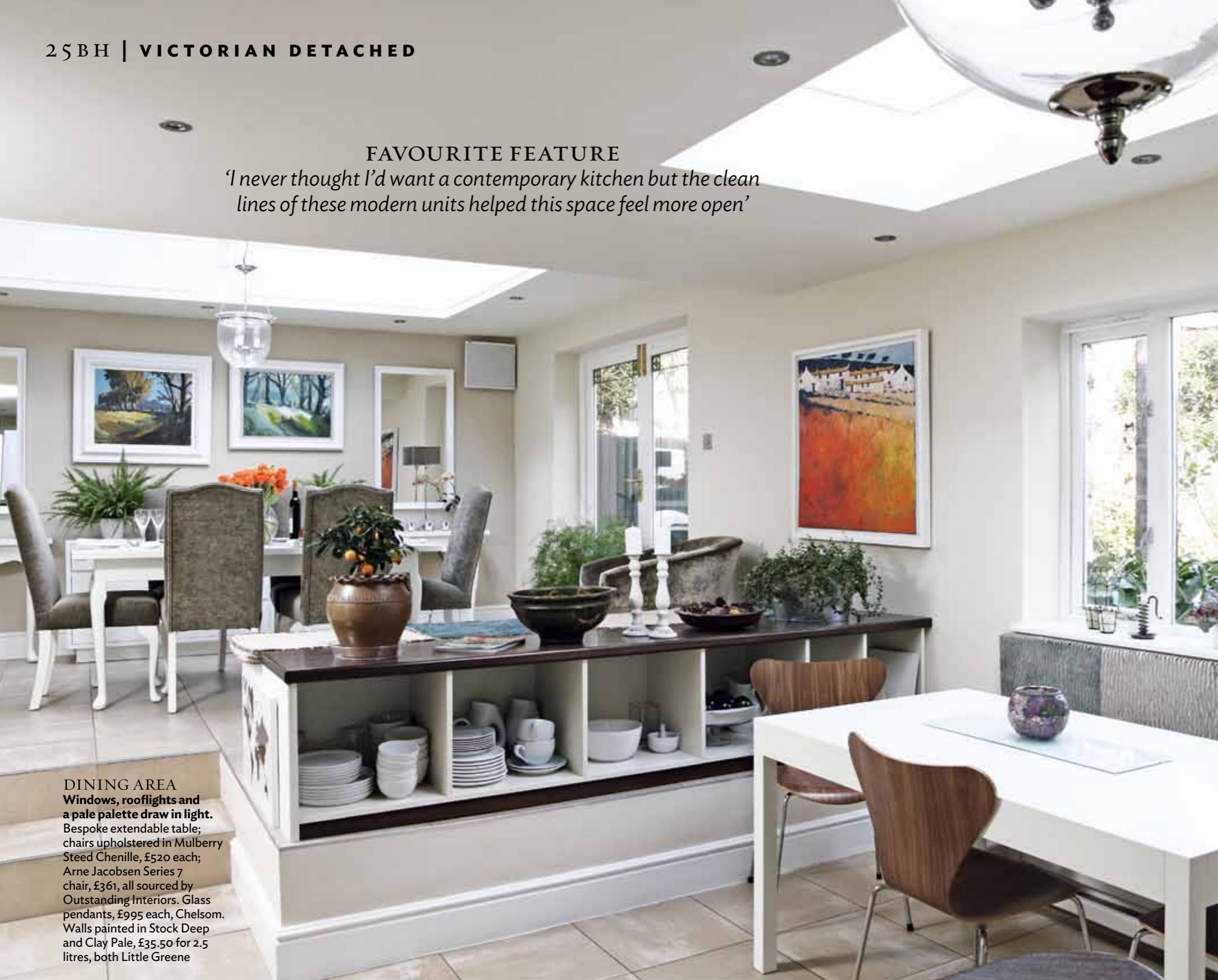
DINING AREA Windows, rooflights and a pale palette draw in light. Bespoke extendable table; chairs upholstered in Mulberry Steed Chenille, £520 each; Arne Jacobsen Series 7 chair, £361, all sourced by Outstanding Interiors. Glass pendants, £995 each, Chelsom. Walls painted in Stock Deep and Clay Pale, £35.50 for 2.5 litres, both Little Greene

'I never thought I'd want a contemporary kitchen but the clean lines of these modern units helped this space feel more open'